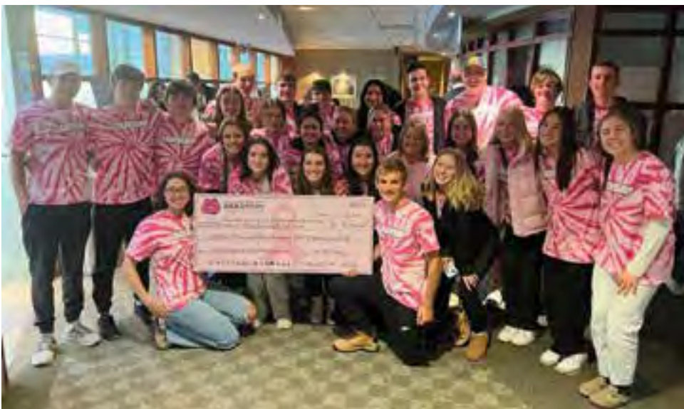
The Brighton High School Leadership Class proudly presents their Pink Week contribution to the Warren R. and Lauraine A. Hoensheid Cancer Center in Brighton.