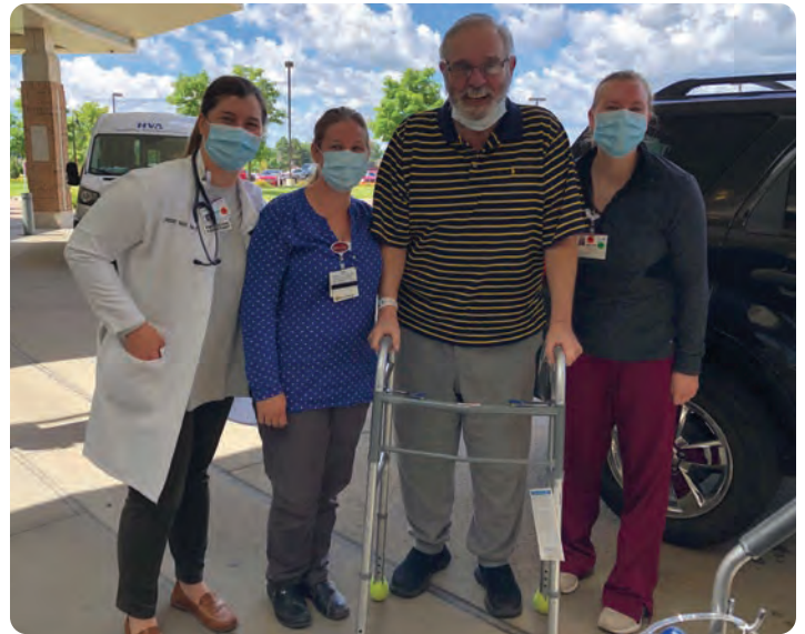
With help from family and St. Joe's, COVID plasma patient goes home