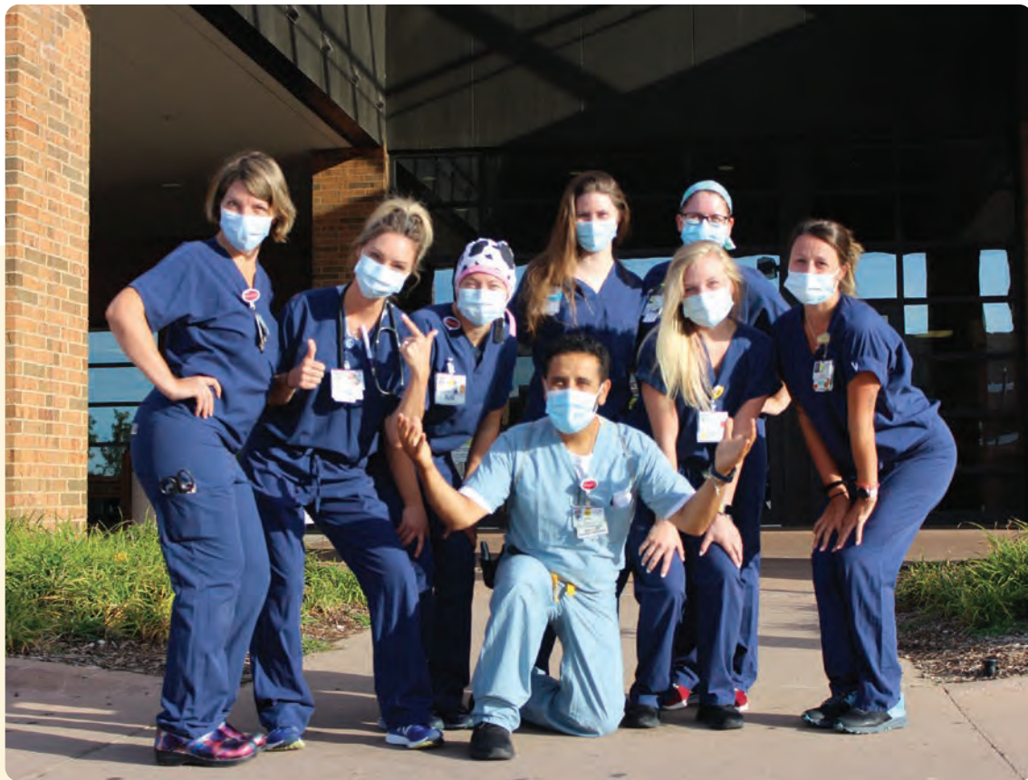
Our frontline healthcare workers show their gratitude for PPE, including gifts of face masks from Ford Motor Company and SLI Medical.